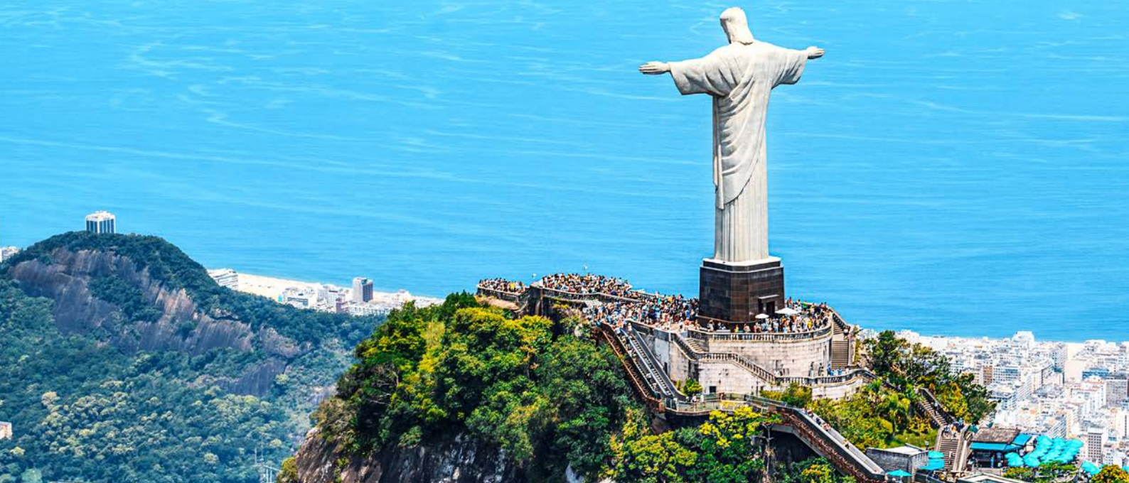
Christ the Redeemer, Rio de Janeiro